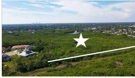
36 Acres M/L