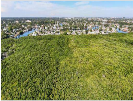
Part of acreage