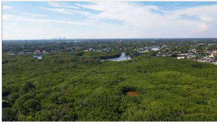
Part of Acreage